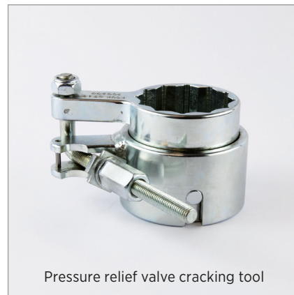
Pressure relief valve cracking tool

To ensure complete safety throughout the valve exchange, we strongly recommend that you follow up with the SafeSwap (also made by MAKEEN Gas Equipment) to protect against accidental valve ejections.